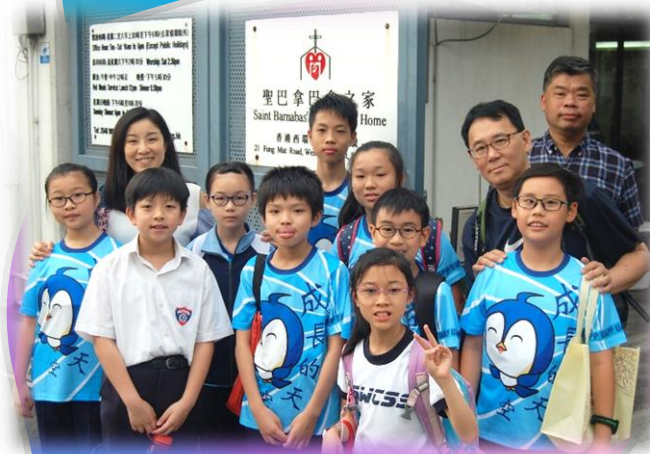
June 2018 San Wui Commercial Society School "The Boys' & Girls' Clubs Association of Hong Kong -Volunteer Group" hosted program, served dinner at Centre.