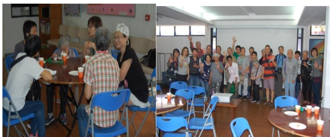
20180424 Under the bridge blessing station and centre joint inspiration course