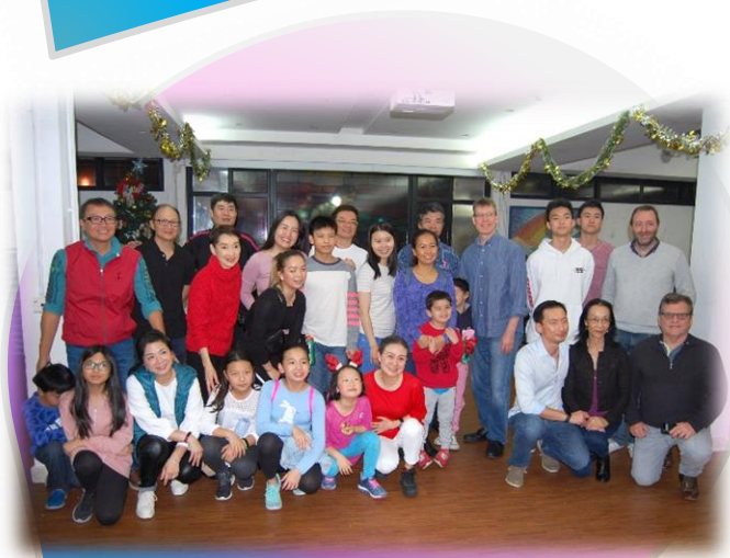
December 2018 Union Church hosted programs and sponsored gift bags during Christmas celebration at Centre.