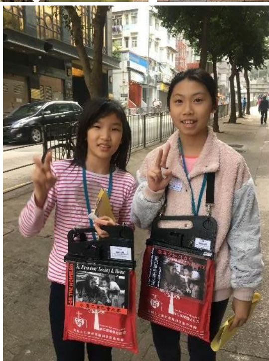
Flag Day on 26 th of Jan 2019