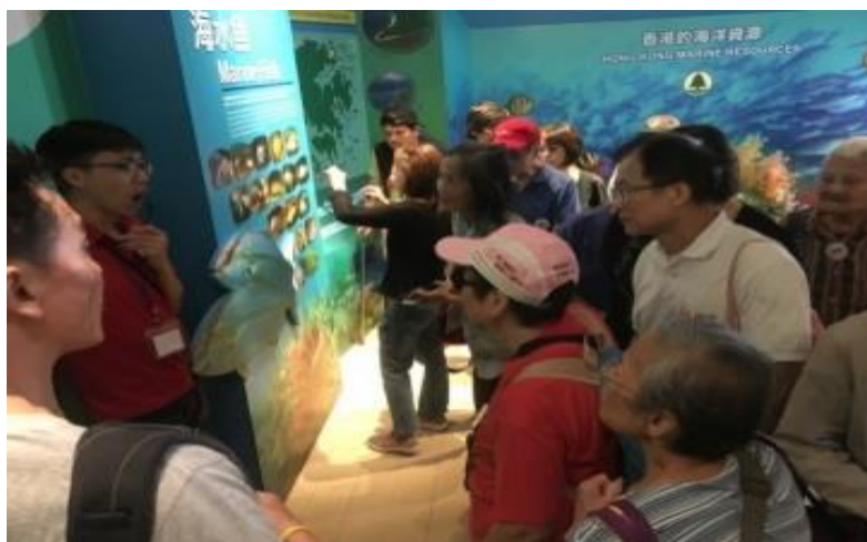
20181121 Centre Outing