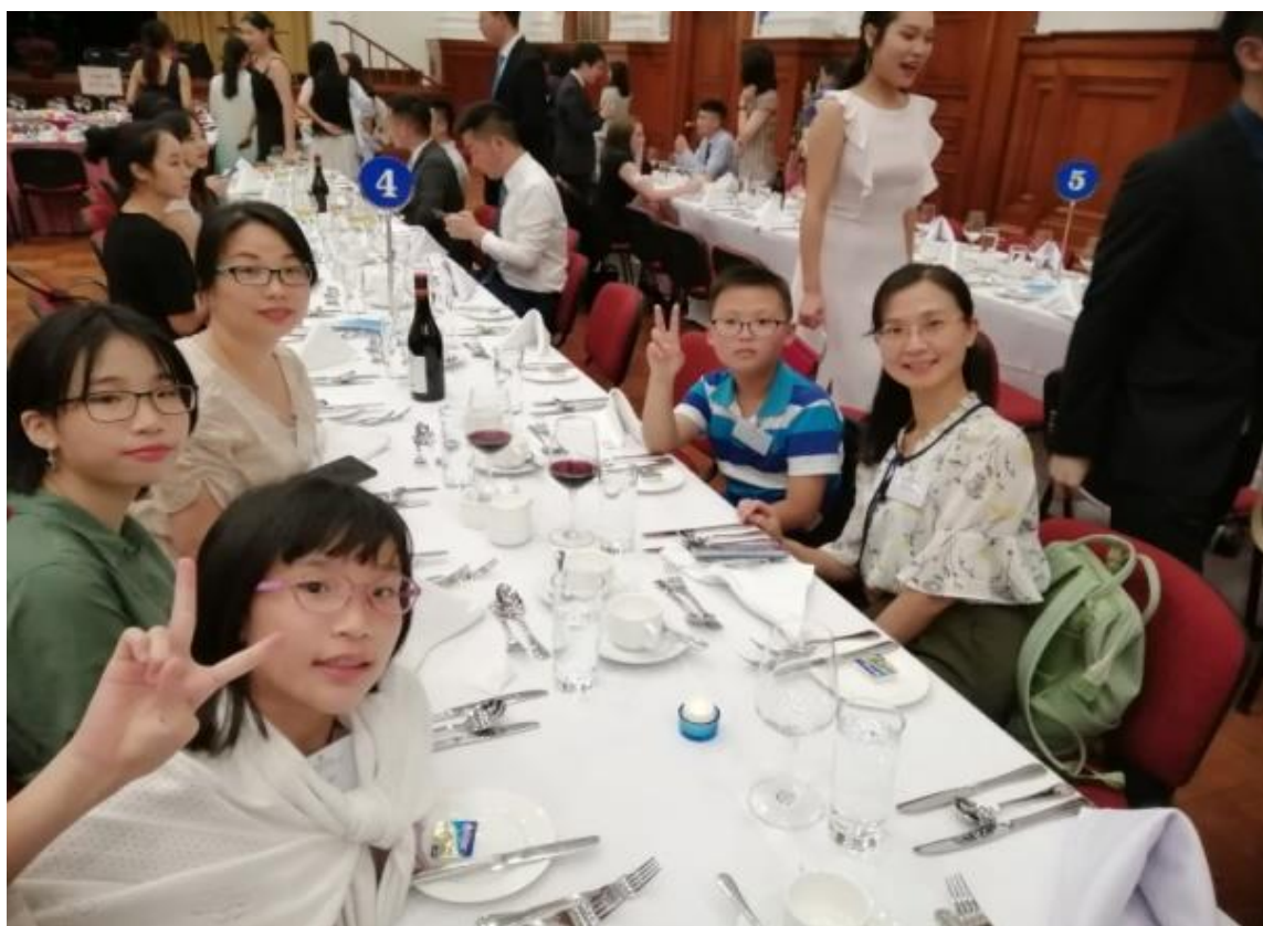
HKU Graduate House High Table Dinner 2019