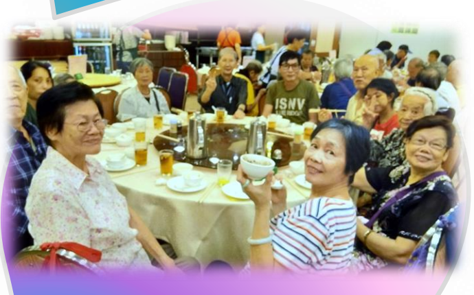
September 2018 The Italian Women's Association sponsored Mid-Autumn Festival dinner at a Chinese restaurant.