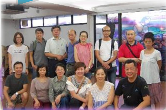
August 2018 Volunteers from Evangelical Church of All Blessings hosted Saturday fellowship and served dinner at Centre.