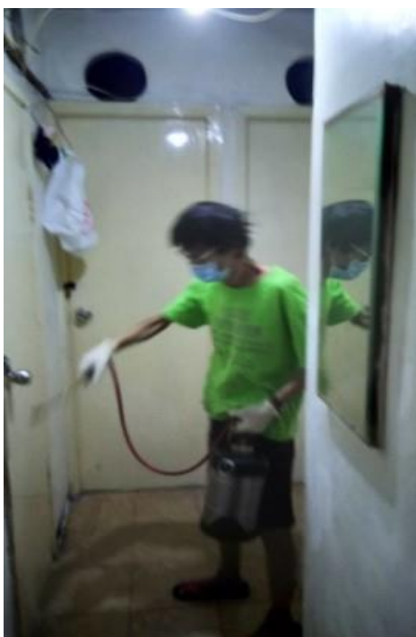
Flea removal in Central and Western District project2018