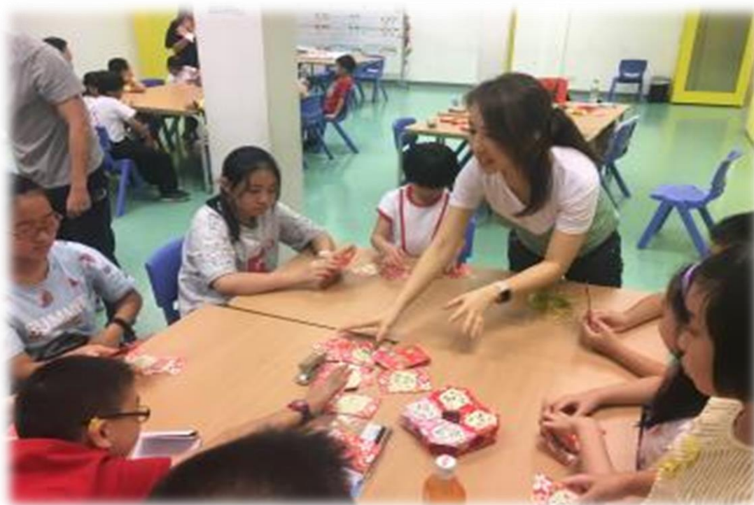
Sunday Interest Class 2018