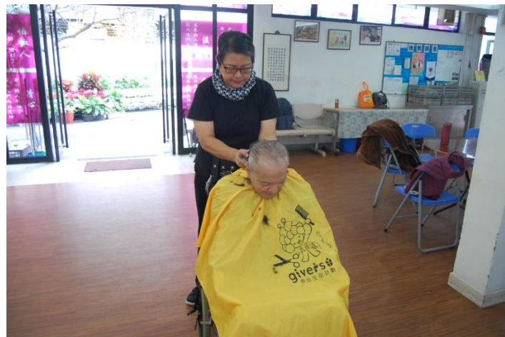
Givers regularly provided free hair cut services to our Centre 2018