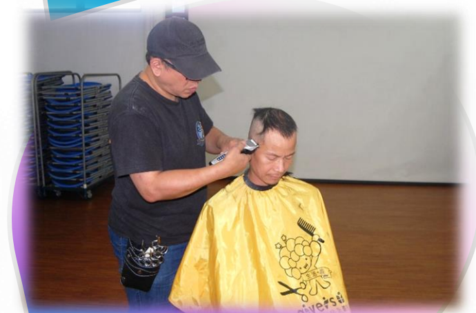
July 2018 Givers free hair cut services