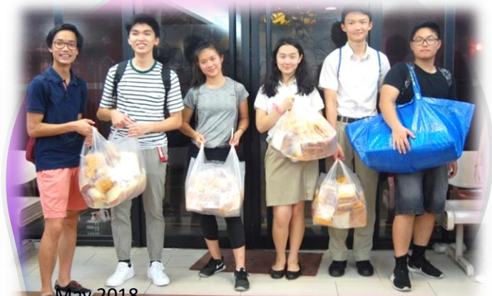
May 2018 King George V School students joined our Centre outreach.