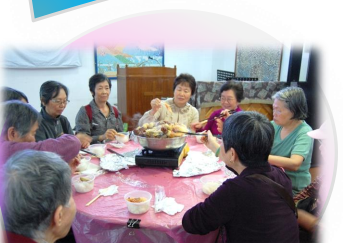
March 2019 Hong Kong Baptist Church sponsored Poon Choi at Centre.