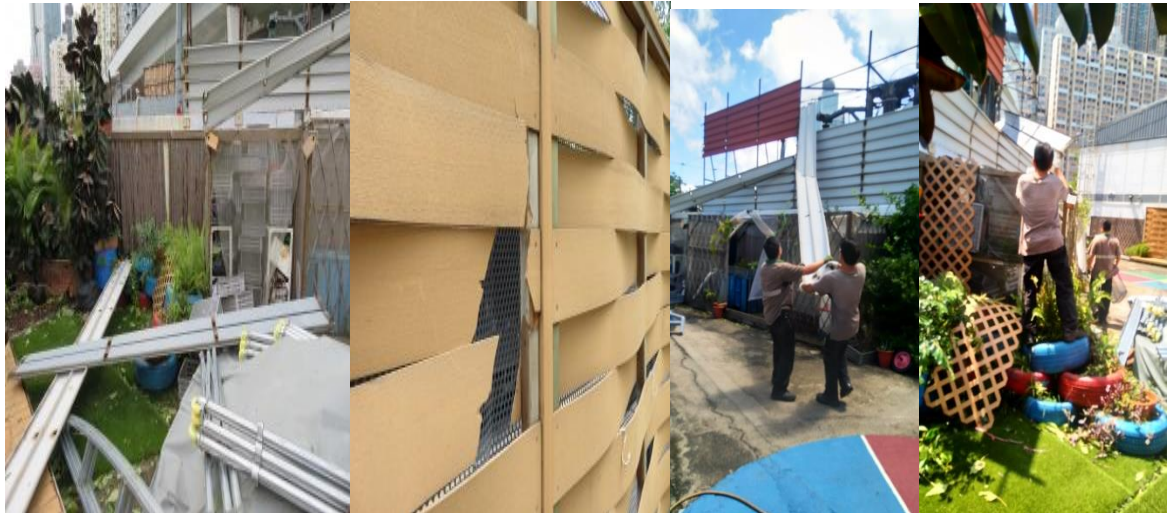
20180917~18 After Super Typhoon Mangkhut, Tram company sent personnel to clean up the damaged items.