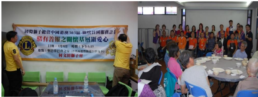
Ho Man Tin Lions Club 20180505 in the centre to host the “Nice meals have good returns” at the grassroots level