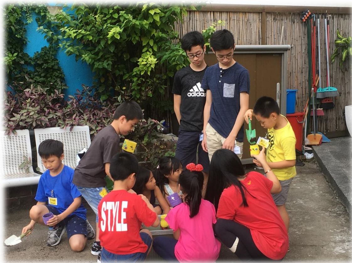
Summer Day Camp 2018