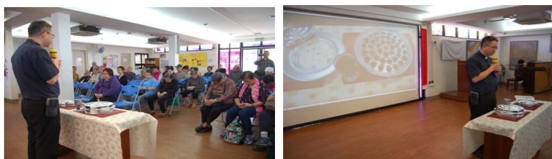
20190330 Holy Communion Worship (First time)