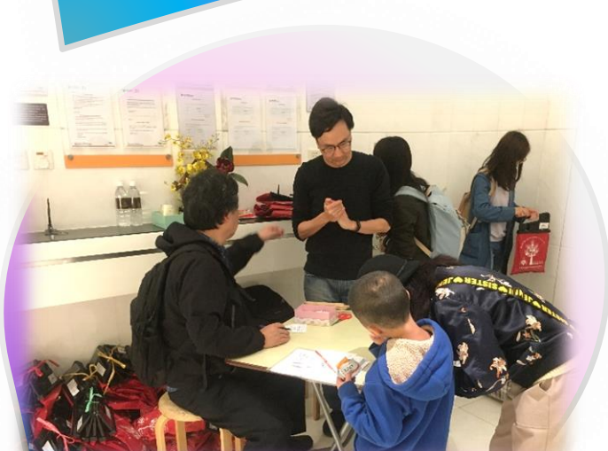
January 2019 Centre Flag Day.