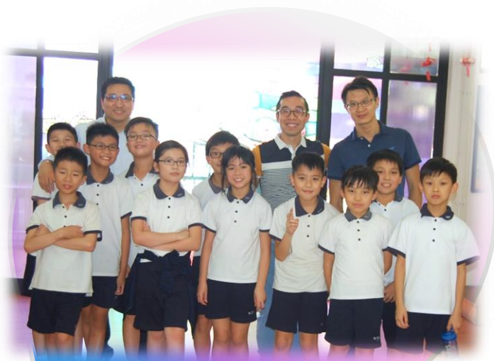
October 2018 Kau Yan School students hosted programs and served lunch at Centre.