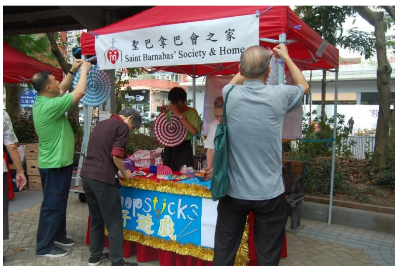
One of our Centre's booths in Central and Western District Carnival 2018