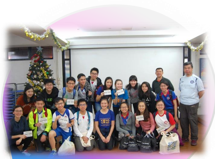
November 2018 Po Leung Kuk Choi Kai Yau School students social service week. They served dinner and joined Centre outreach.