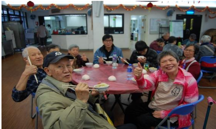
20190211 Faith Hope Love Group co-organized "Thousand Ages Love meals"