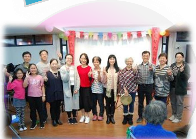
February 2019 Volunteers from Free Sing Zheng Ensemble