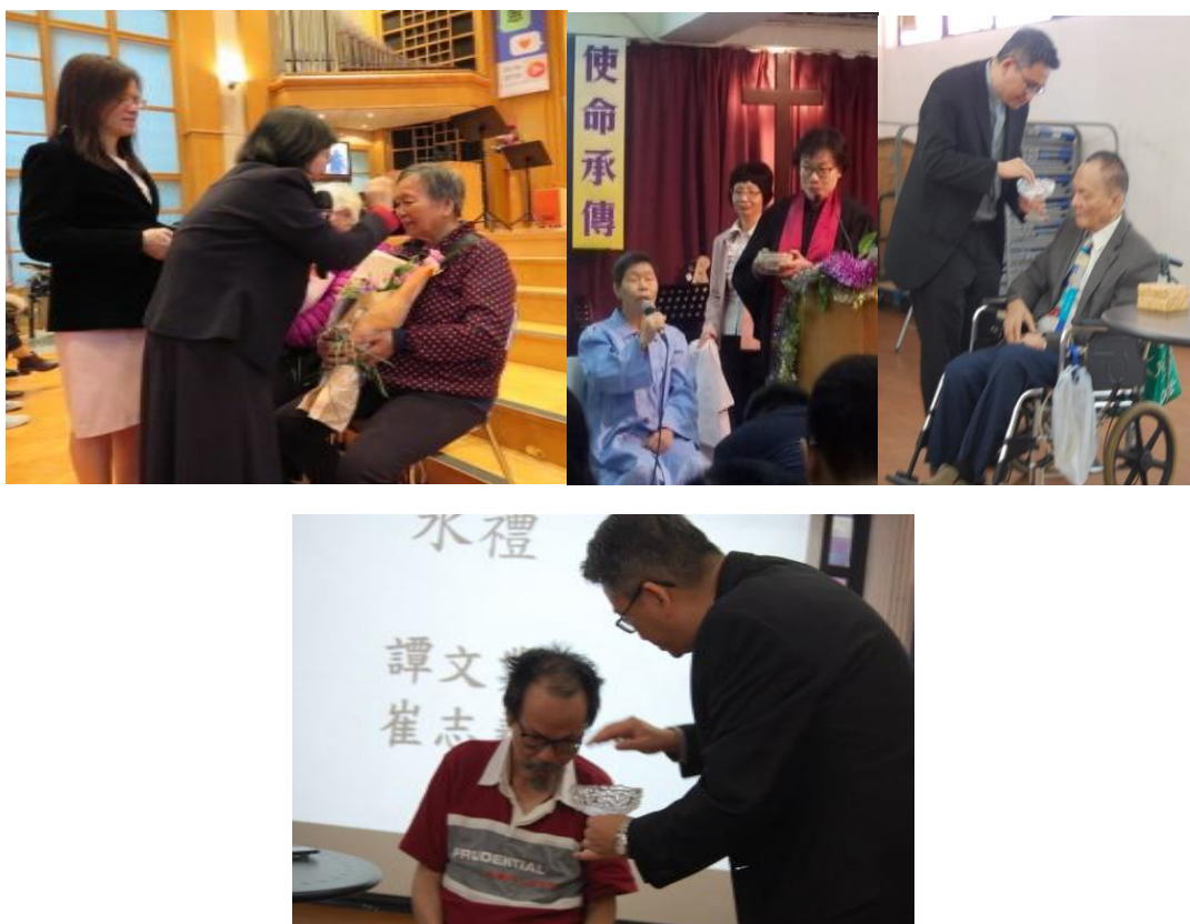
Friends of the Centre this year are baptized into different churches