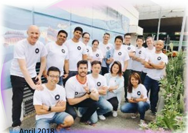
April 2018 Macquarie Group Community Day at Centre.