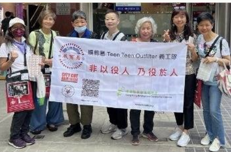
感激不同的義工參與。 The participation of volunteers from all over Hong Kong is appreciated.