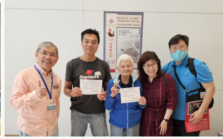
少壯銀髮賣旗樂。 Happy donation drive by the strong and the elderly.