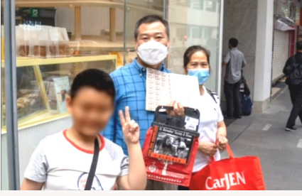
大人細路齊出動 為善賣旗樂融融。 Adults and kids join forces to sell sticker flags for Charity.