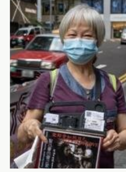
老友記參與做賣旗義工,樂也融融。 SBSH Service users participate in the flag day joyful as volunteers.