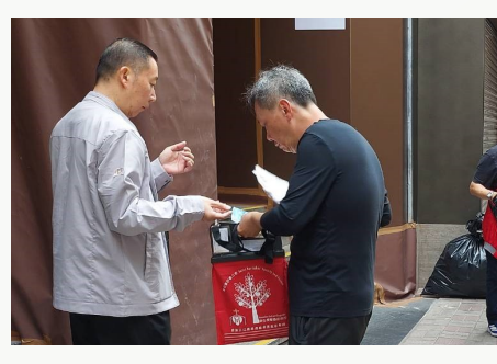
老友記互相配搭,分工合作賣旗。 They cooperate and work together for donations.