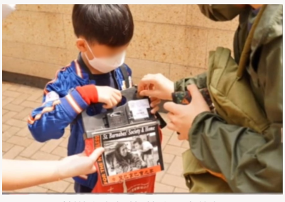
教導小童行善 養成一生德行。 Teach a kid to do good and he will know how to do good for life .

中心與橋下祝福站合作的啟發課程已展開,報名人數有 60 人,求主在感動參與的朋友願意洗禮歸主。