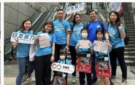
一家大細參與賣旗活動,實踐社區服務。 A whole family participates in the donation drive for community service .