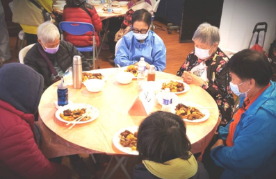
禱告感恩上帝的施予。 Pray and thank God for His provision.