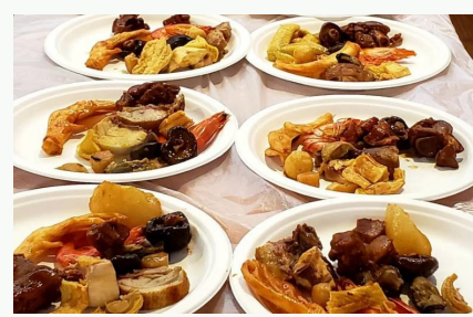
久違了的盆菜美食。 The long-waited Big Pot Feast delicacy.