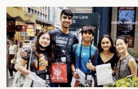
各族共融為公益,齊心合力襄善舉。 All races work together for the common good