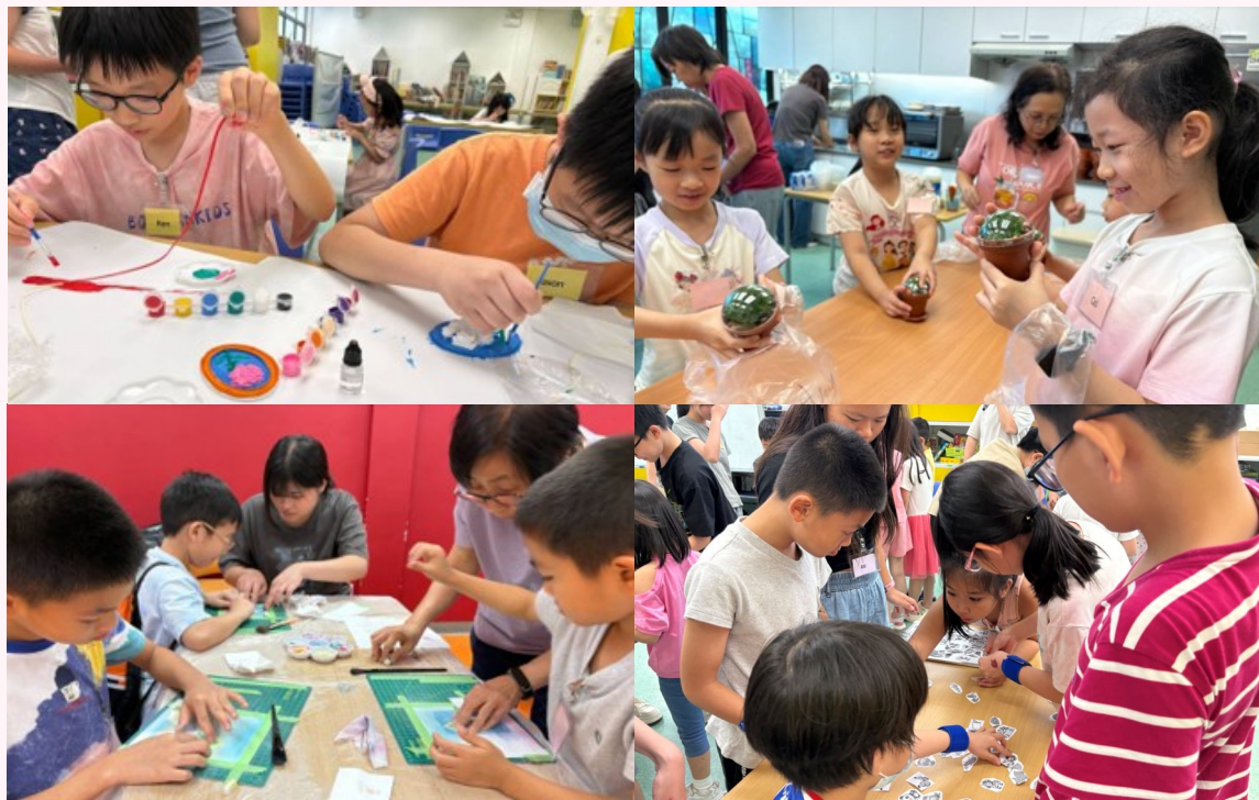
小朋友在暑假期間營從歡聲笑語中學習聖經和參與各樣興趣小組。 During the summer day camp, the children engaged in joyful biblical learning alongside participation in various interest groups.