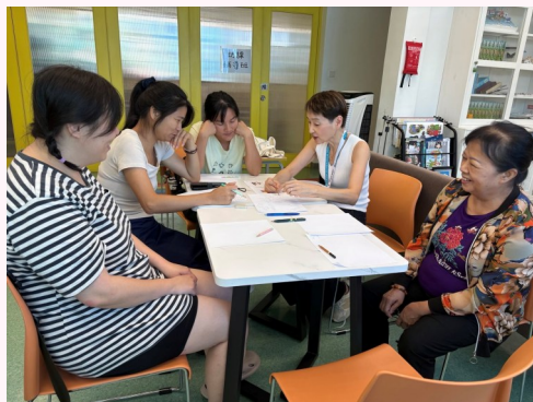
新學年的英文之星開課了，家長也同來學英語。 The new academic year has commenced with the English Star program, attracting not only children but also their parents eager to learn the language.