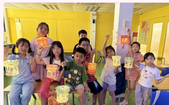
小朋友自製燈籠迎中秋格外開心。 The children took great delight in crafting lanterns to celebrate the Mid-Autumn Festival.