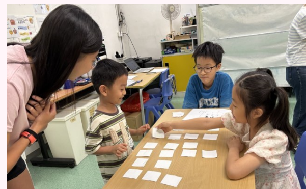
暑假期間，感恩有香港佑寧堂的義工來教小朋友英語拼音。 Throughout the summer break, we are thankful for the volunteers from CNEC Union Church who taught the children English phonics.