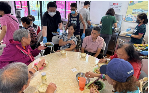
Sunny Precision 義工協助派飯

Members from 愛家 shared insights on "The Secrets of Happiness."