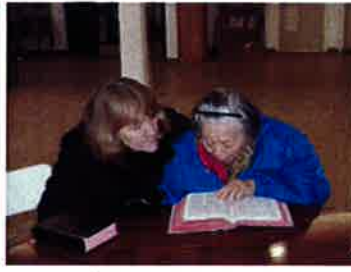
Bible Study 查經