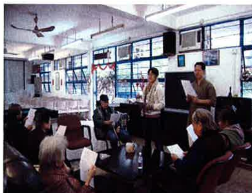
Fellowship 團契小組 (詩歌分享)