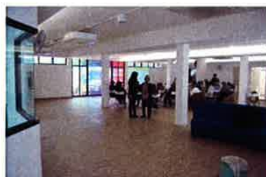
Drop-in Centre 日間中心