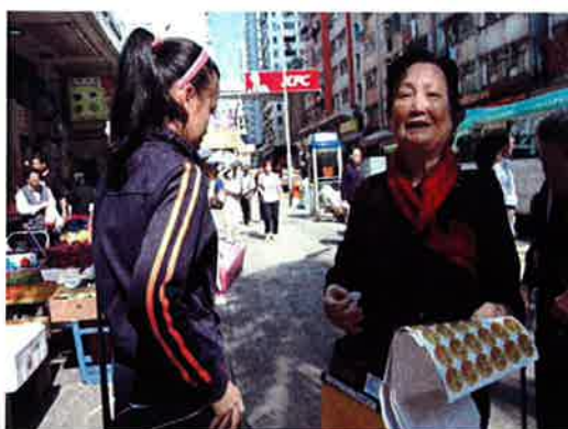
Service users involved in various volunteer services (Flag-selling) 中心使用者參與社區服務 (賣旗)