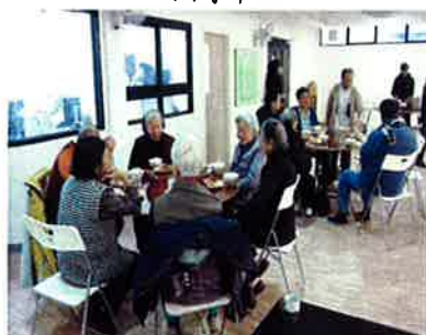
Meal Services 膳食服務