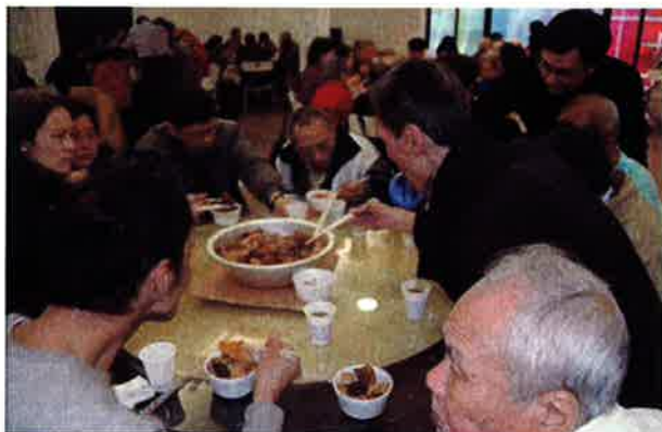
Social Activity 社交活動