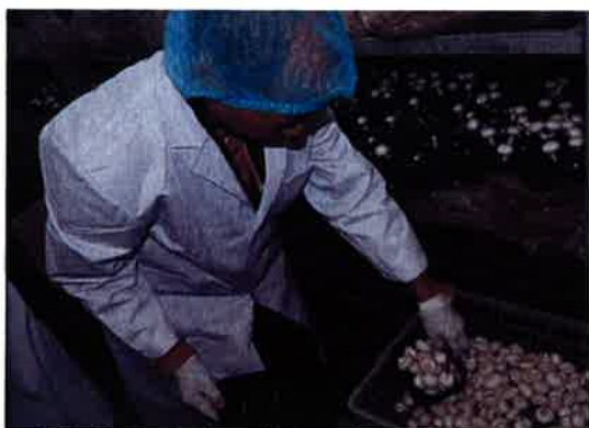
Work Training (Organic Mushroom Growing) 工作訓練 (有機蘑菇種植)

工作訓練—露宿者自立支援計劃讓露宿朋友參與及生產可銷售的產品。 中心使用者參與社區服務—我們鼓勵中心使用者參與各種義工服務。 例如：賣旗、嘉年華會和其他服務社區活動。