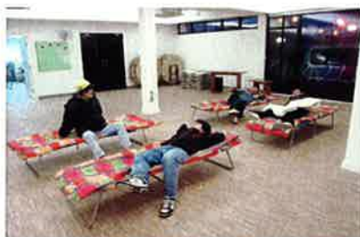
Temporary Shelter 臨時庇護