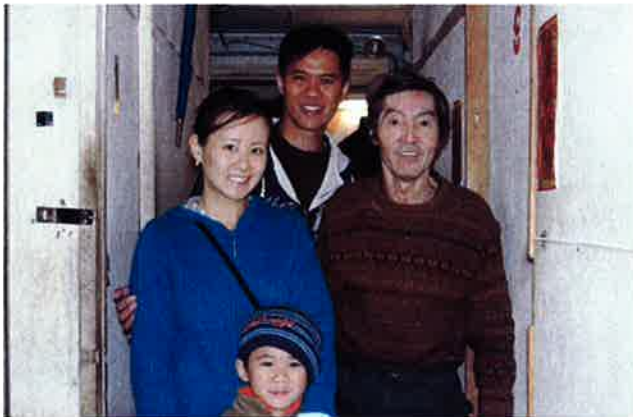
Service visits by individuals and organizations 個人或團體探訪