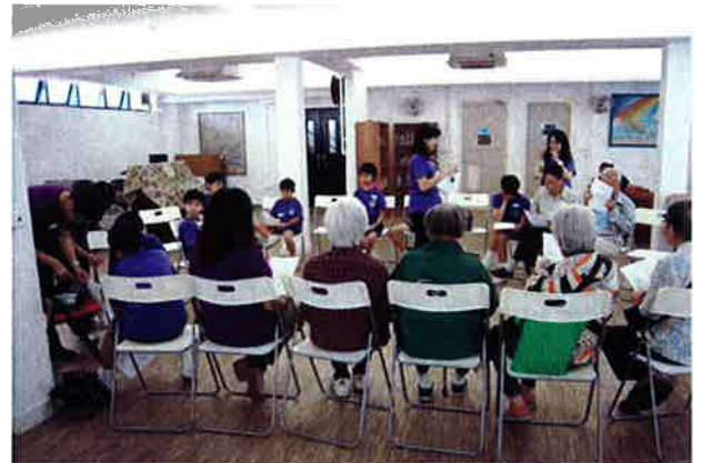
Volunteer Activities 義工活動